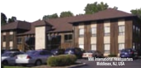
MMI International Headquarters Middlesex, NJ, USA

Best wishes for a very happy holiday And a peaceful, content 2009